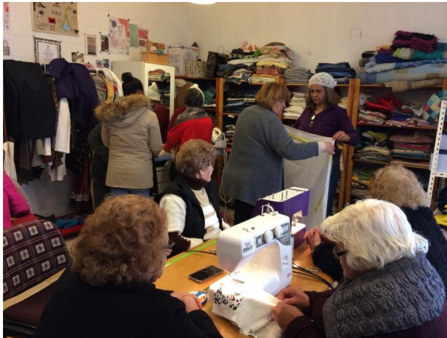
Building a Diversity Blanket, Lisbon, Portugal, 20 th – 26 th February

The results of the pilot projects are the following; the activities successfully provided an interaction between the different target groups as well as the integration of people from different cultures within the diverse community of the area. This in turn helped establish a relationship between the citizens from different cultures and nationalities and promoted a space for an intercultural dialogue. Moreover, the sports activities were used as a tool for the promotion of integration through non-verbal communication which provided inclusion for those who did not speak sufficient Portuguese. The projects overall also created a network of partners who share the same concerns in order to further produce collaborative projects.