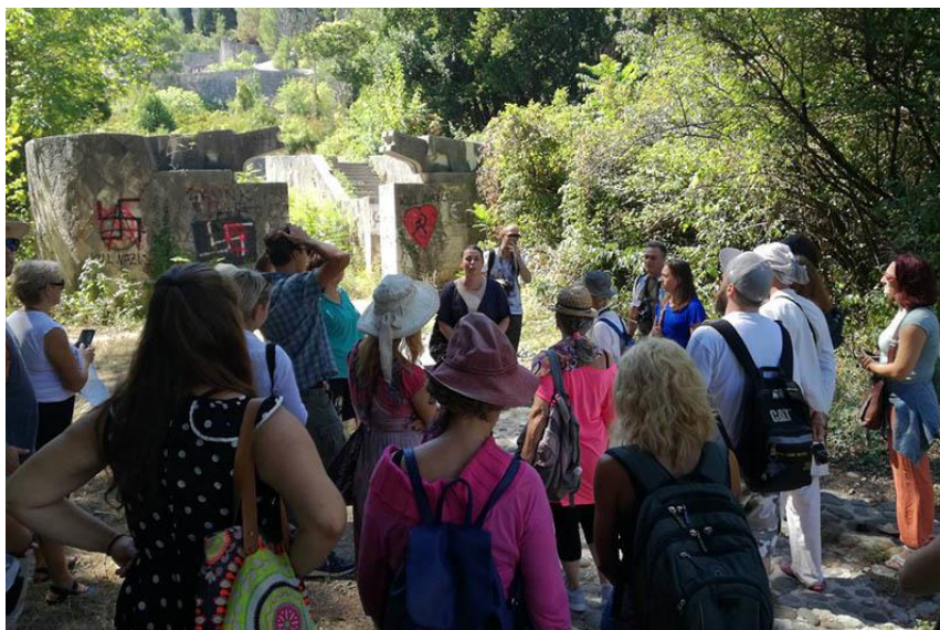
Cultural tour “Monuments in Motion”, Mostar, Bosnia & Herzegovina, 6 th September 2017

chance to see the exhibition which chronologically showed the work of the workshop and the materials derived from it in the form of posters.