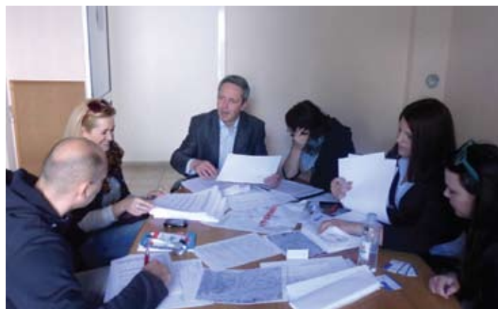
Training for surveyors

Preparatory meetings with representatives of the City of Mostar (Advisor of the Mostar City Mayor and Head of Department for organisation, legal affairs, general administration, civil protection and fire fighting), Municipality of Konjic (Municipal Mayor, Mayor's Assistant and Co-ordinator of Local Communities) and Municipality of Jablanica (Mayor's Assistant and Head of Department for general administration, social affairs, protection of the disabled and war veterans and social issues) took place in the period January – February 2012. The meetings were an opportunity to present in detail the "Monitoring of public services on local level – citizens and local authority together to better services" Project as well as an agreement which LDA Mostar should sign with the City and Municipalities.