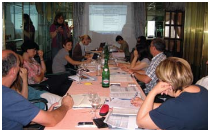
Project Team meeting in Mostar