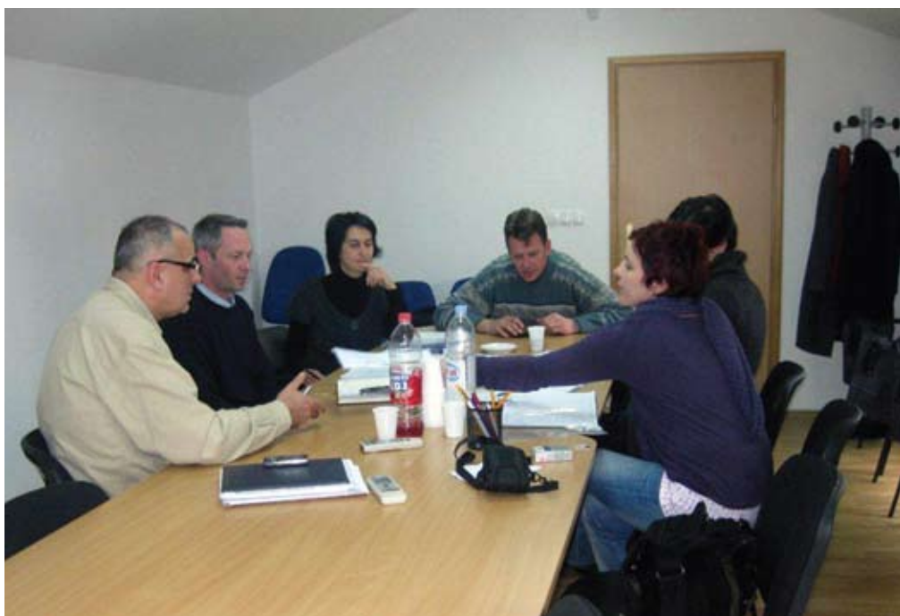
Coordination meeting of partners

The Call was open from 30 December 2011 until 15 February 2012 and was intended for citizen associations and non-profit organisations coming from the area of Trebinje, Ravno, Ljubinje and Čapljina Municipalities and the area of Popovo polje.