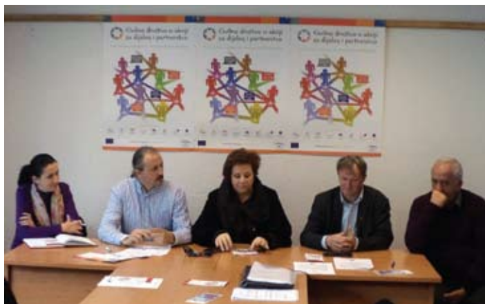
Working Groups in Bihać