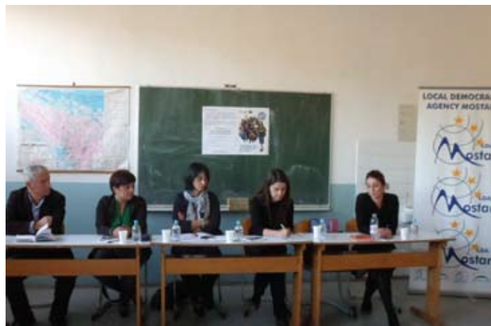
Workshop in Vrapčići (near Mostar)