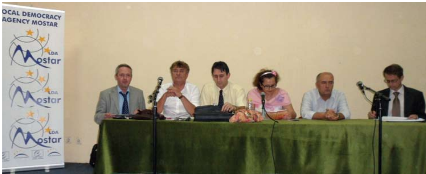
Public tribune in Konjic

Local democracy agency (LDA) Mostar organised a Public tribune with candidates for the position of Konjic Municipality Mayor on 27 September 2012 in the Wooden Hall of the Community Centre.