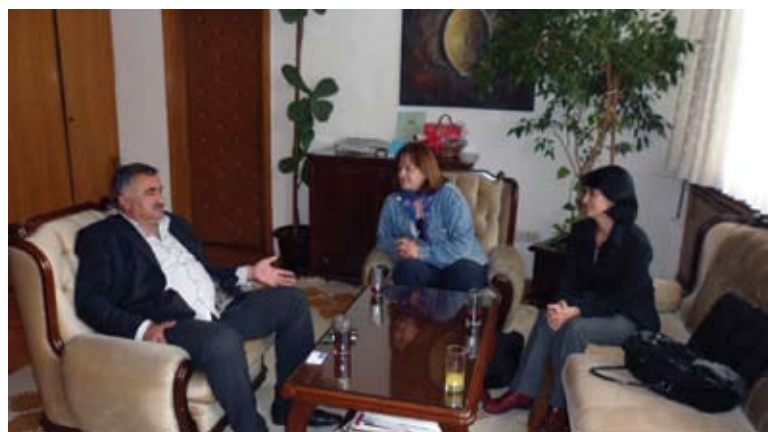
Meeting in Nikšić (Montenegro)