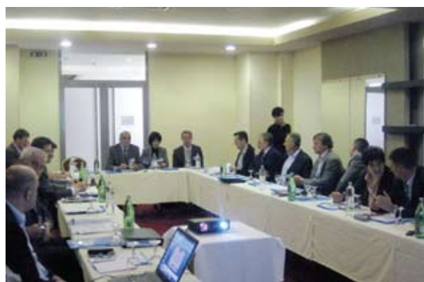
Rounded table in Čapljina

Agreements on implementation of small scale projects were signed on 05 March 2012. Mutual obligations of the contractor and organisations granted the funds were regulated by an agreement, which is in accordance with the BiH legislation. All projects that were approved had to be implemented within a three-month period.