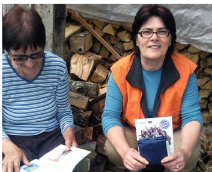
Workshop in Vrapčići (near Mostar)