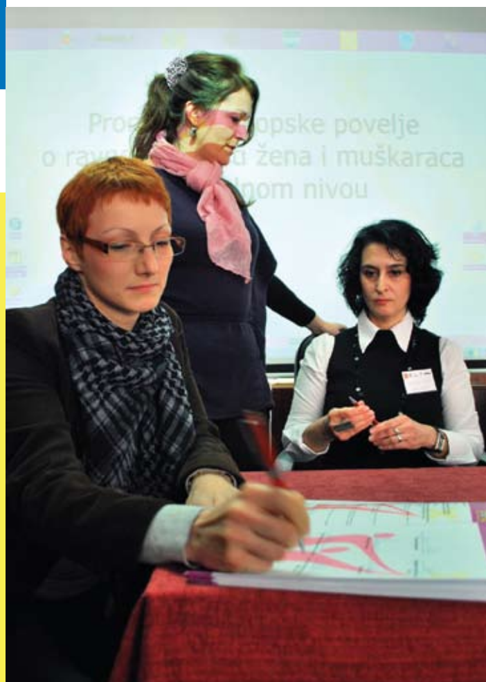
Signing Protocol on co-operation, Kraljevo 28.02.2012.

Creation of local policy of equality of “vulnerable“ groups is the first step towards the increase of visibility of a female role in the decision making process and a throne for one of the most important parts of development of participative democracy on local level.