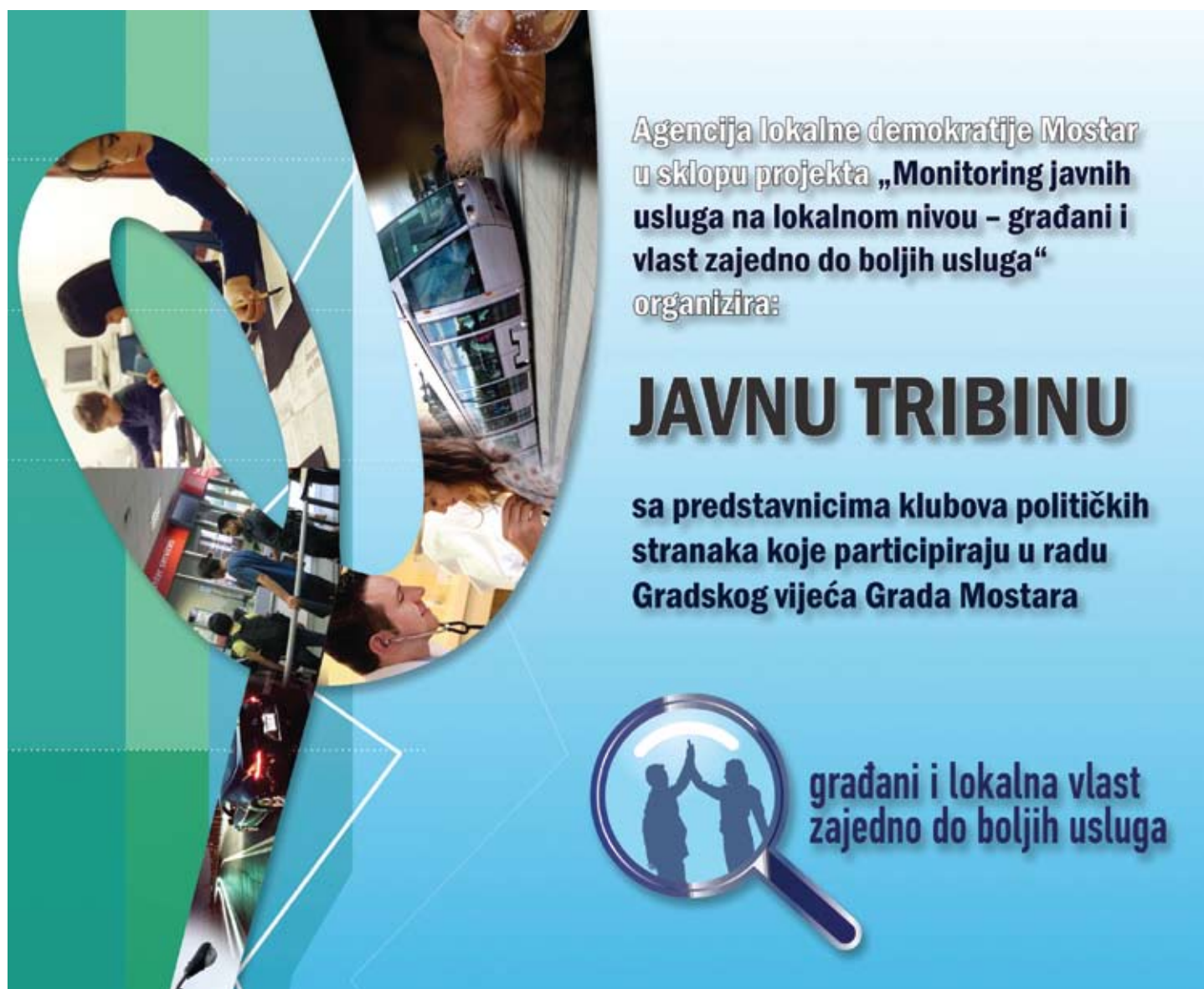
Poster designed for Public tribune in Mostar

Public tribune with the representatives of caucuses of political parties which participate in the work of the Mostar City Council took place on 22 November 2012 and was organised by Local Democracy Agency Mostar. Results of the survey on citizen satisfaction with sixteen public services, implemented in the City of Mostar by Local democracy agency (LDA) Mostar, which were based (results) on surveying overall 1135 households on the territory of all 43 Local Communities of the City of Mostar, were the subject of the discussion at the Public tribune.