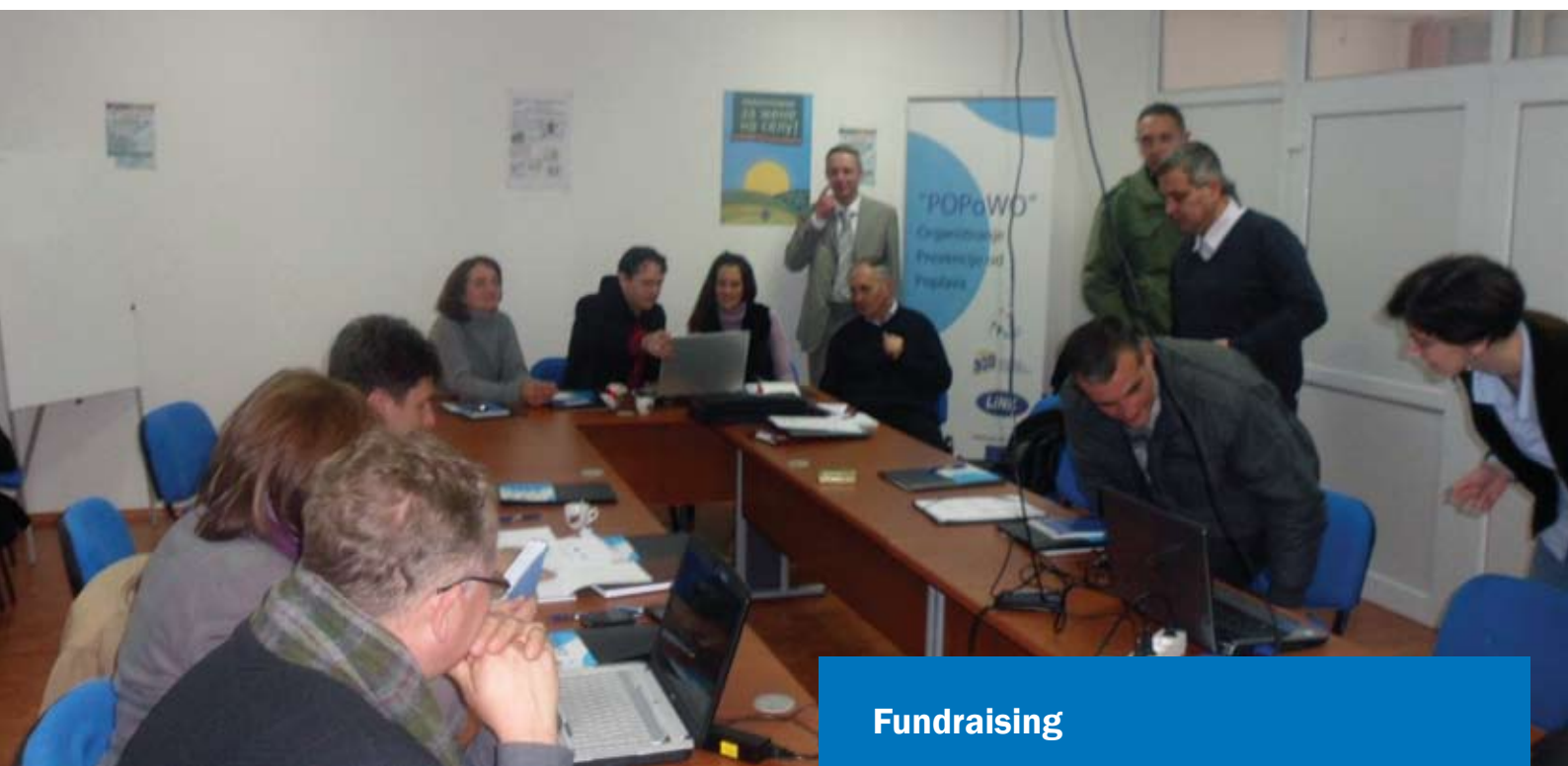
Training workshop in Trebinje

The next topic was participation as a process of gathering the views of a variety of stakeholders, particularly those whose interests may be at stake, and ensuing decision-making process that takes such, sometimes conflicting, views into account. The participation is also seen as a vehicle for embarking upon changes that bring about changes and benefits to the local community.