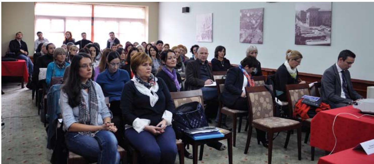
Final Conference in Mostar

• Publications issued by the Council of European Municipalities and Regions (CEMR) were also publicised: