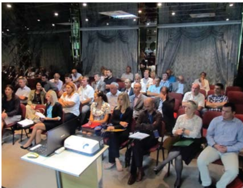
Final Conference of the project

The POPoWO Project was very positively evaluated by all participants, while the need for further activities related to prevention of floods in Popovo polje was emphasised.