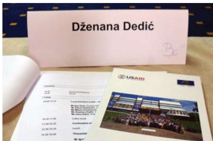
Final Seminar, Sarajevo