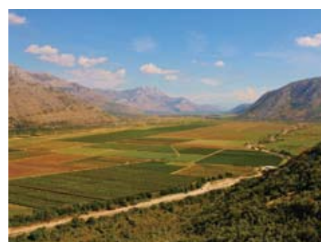
Popovo field without water