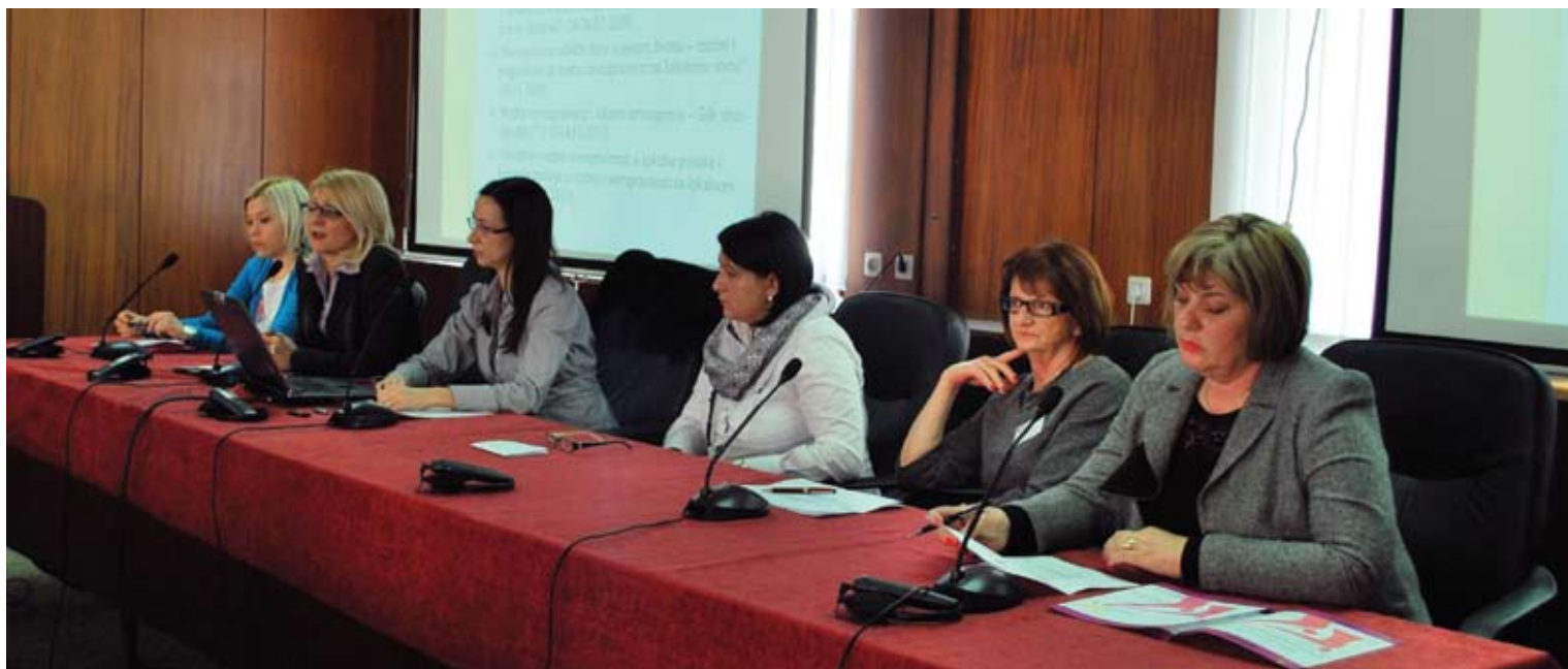
Conference in Kraljevo