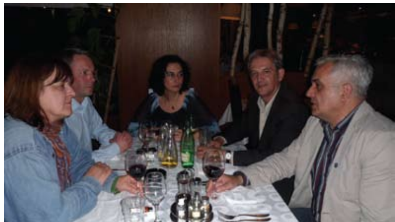
Meeting with the Mayor of Mostar