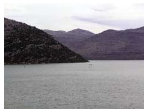
Popovo field under water