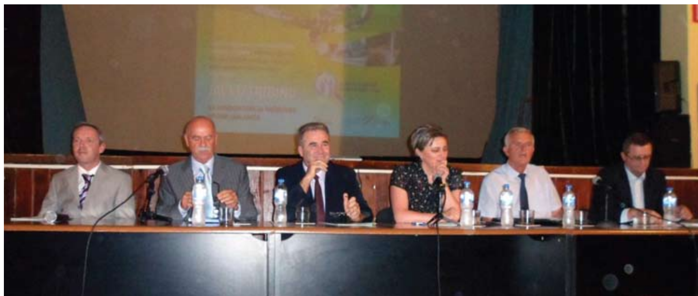
Public tribune in Jablanica

Upon the completion of the survey, LDA Mostar checked the work of the surveyors. Random check of 5% of the surveyed households was conducted for Konjic, Jablanica and Mostar. Local Democracy Agency Mostar, together with volunteers engaged on the Project, completed the data (surveys) entry in the period from 23 April to 04 May.