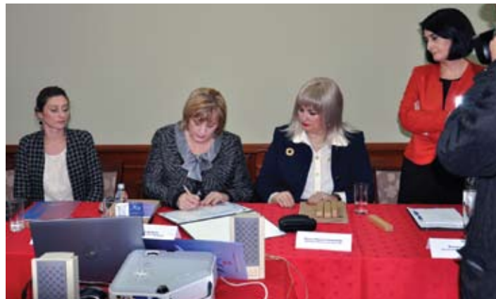
Signing of European Charter, Mostar 02.11.2012.