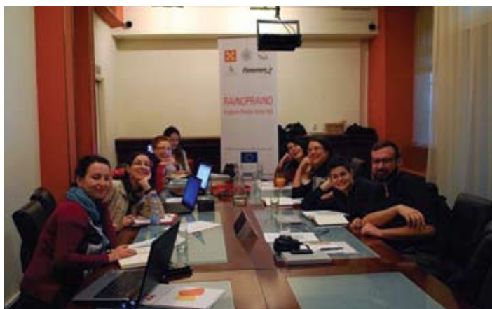
Meeting in Niš