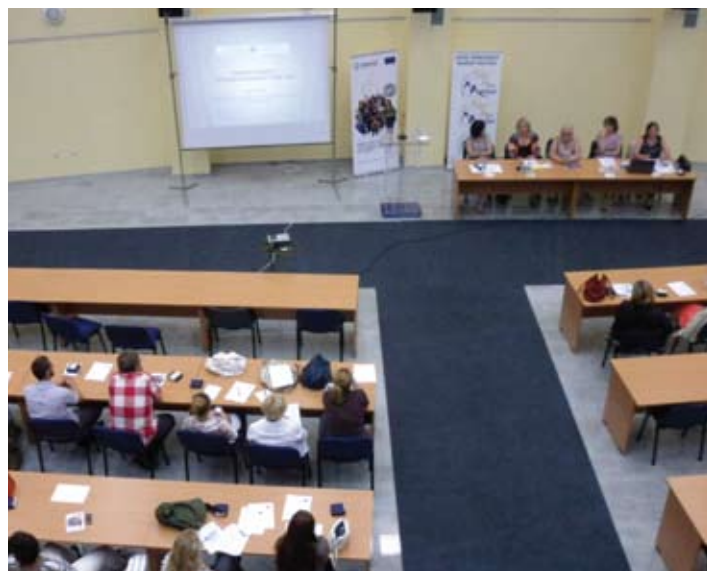
Workshop in Mostar