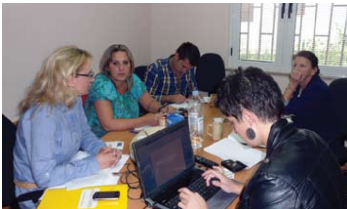
Preparing of Local Action Plan