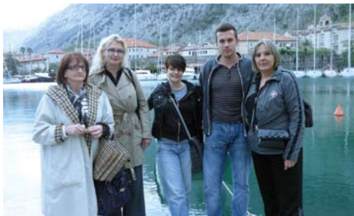
Meeting in Kotor