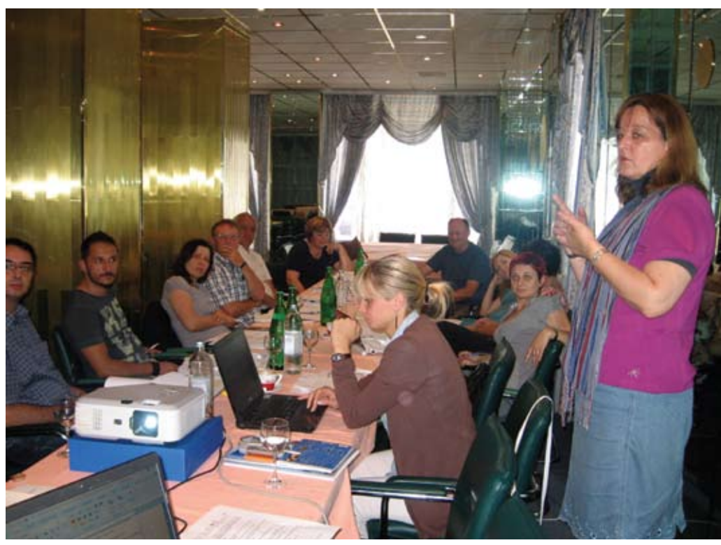
C.S. I upravni odbor Mostar, srpanj 2011.