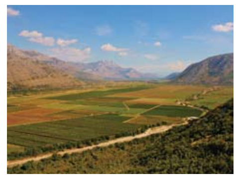
Popovo field without wather

This Project will open up the room for communication of all stakeholders but will also address capacity building of civil society aiming to strengthen its political representation.