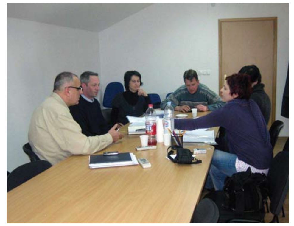
Koordinacijski sastanak partnera

5. Local Democracy Agency Mostar, within the POPoWO Project organised in Ljubinje on 13th July 2011, training on the subject of "EU Funds and IPA for Bosnia and Herzegovina". This was the first training organised within the Project framework and its aim was to introduce representatives of municipalities of Čapljina, Ljubinje, Ravno and Trebinje, representatives of public institutions, non-governmental organisations, hunters' associations and agricultural cooperatives to the structure and conditions for receiving EU funds. Some of the subjects that were elaborated were as follows: Instrument IPA 2007 – 2013. EU funds: Support to the realisation of common EU policies, community programmes, 5 components of IPA funds, component 1 "Support to the transition and institutional building" (structure, political conditions, socio economic conditions, European standards, beneficiaries), component 2 "Cross-border co-operation" (purpose, programmes and beneficiaries)