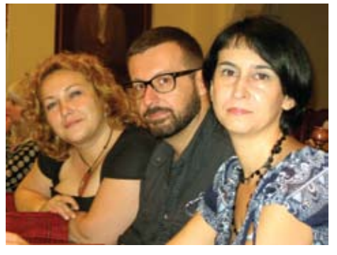
ALDA - Generalna skupština

The Conference was organised as an initiative within activities preceding Poland's takeover of EU chairing. Director of LDA Mostar participated in the mentioned events together with representatives of other Local Democracy Agencies, ALDA, and representatives of cities and municipalities members of ALDA.