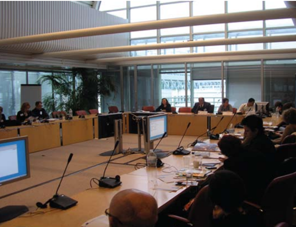
Finalna konferencija u Briselu, ožujak 2011.