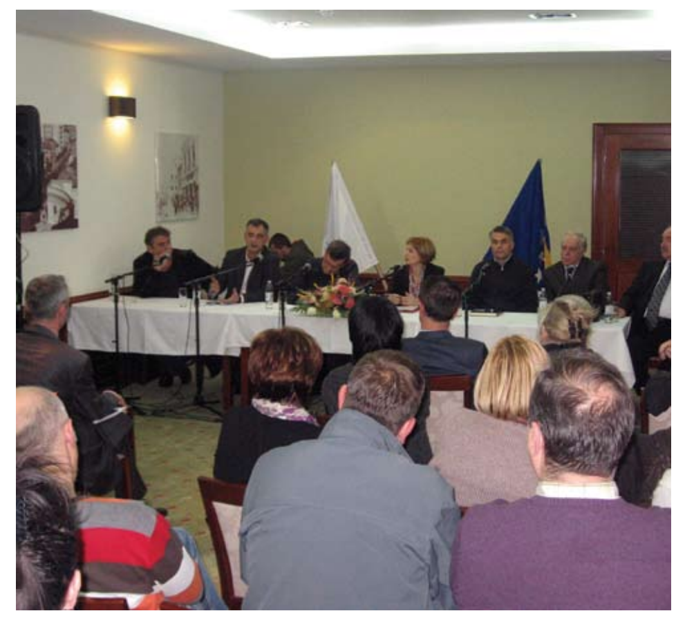
Zadnja tribina za vijećnike u hotelu Bristol u Mostaru, ožujak 2011.