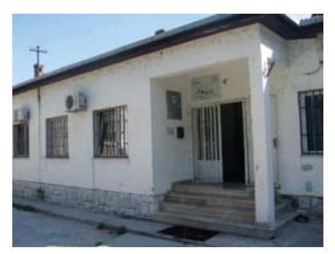
Ured LDA Mostar na novoj adresi

In accordance with this change, LDA Mostar conducted re-registration of the organisation at the Herzegovina-Neretva Cantonal Court and registered the amendments of the organisation's Statute.