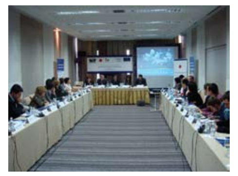
Škola lokalne demokracije Vijeća Europe, Sarajevo, travanj 2011.

• Seminar "Reconciliation – Victims of war" organised by Caritas CRH – 27th May 2011, Youth Culture Centre Abrašević, Mostar