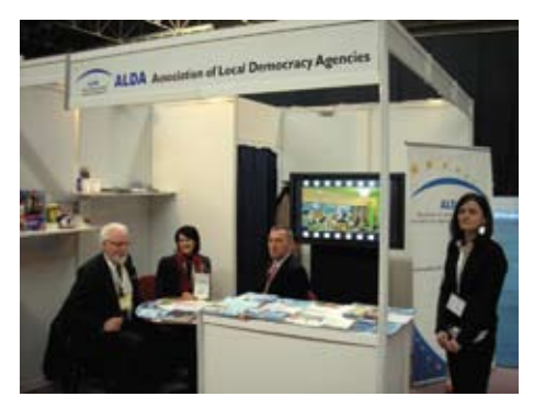
NALAS - Sarajevo, ožujak 2011.

At this Fair, mayors and elected representatives of local and regional authorities signed a Declaration entitled "Facing the future of local authorities; good governance, social inclusion and European integration".