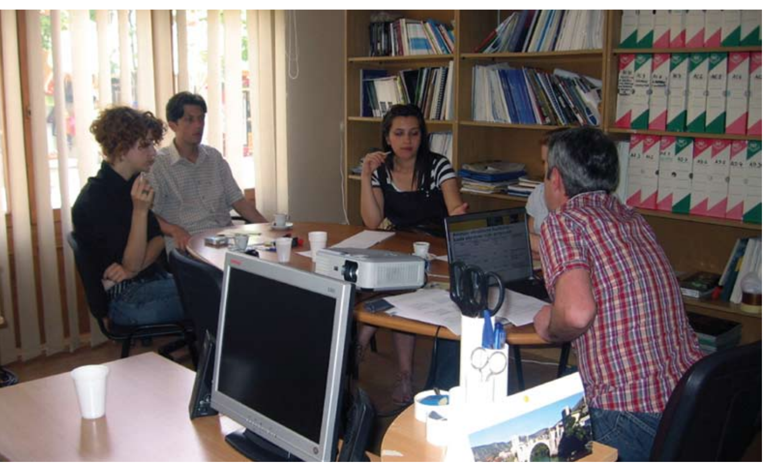
Trening za polaznike škole Mo.Start-v, lipanj 2011.

Considering the importance of communication of this sector in the global context and its development, through this Project a group of young people is professionally enabled in the field of independent video journalism, which should serve them as a tool for comparison, learning, encouragement of dialogue and intercultural exchanges. Apart from that, training was also provided for this group of young people on the subject of "Starting a business", during which a year-long business plan was developed.