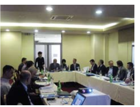
Round table, Čapljina