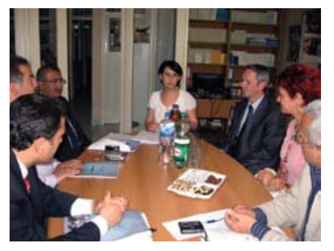
Posjeta delegacije Antalije