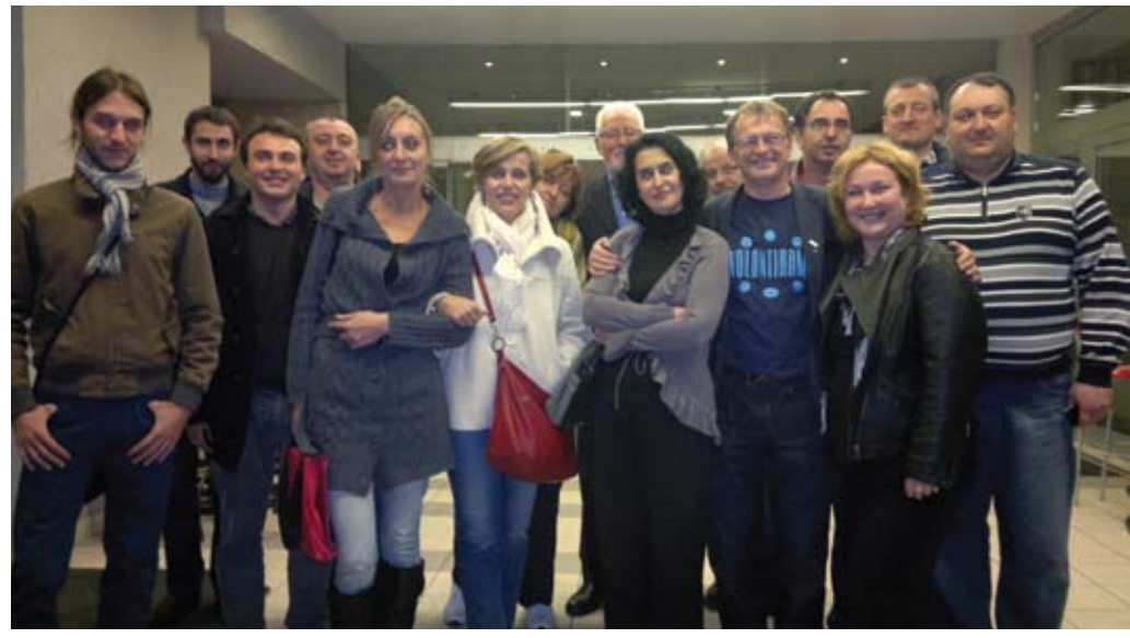
Sisak, studeni 2011.

In accordance with the Resolution issued by the Mostar City Mayor in June 2011, working bodies for the development of the City of Mostar Youth Strategy for the period 2012 – 2015 have been appointed.