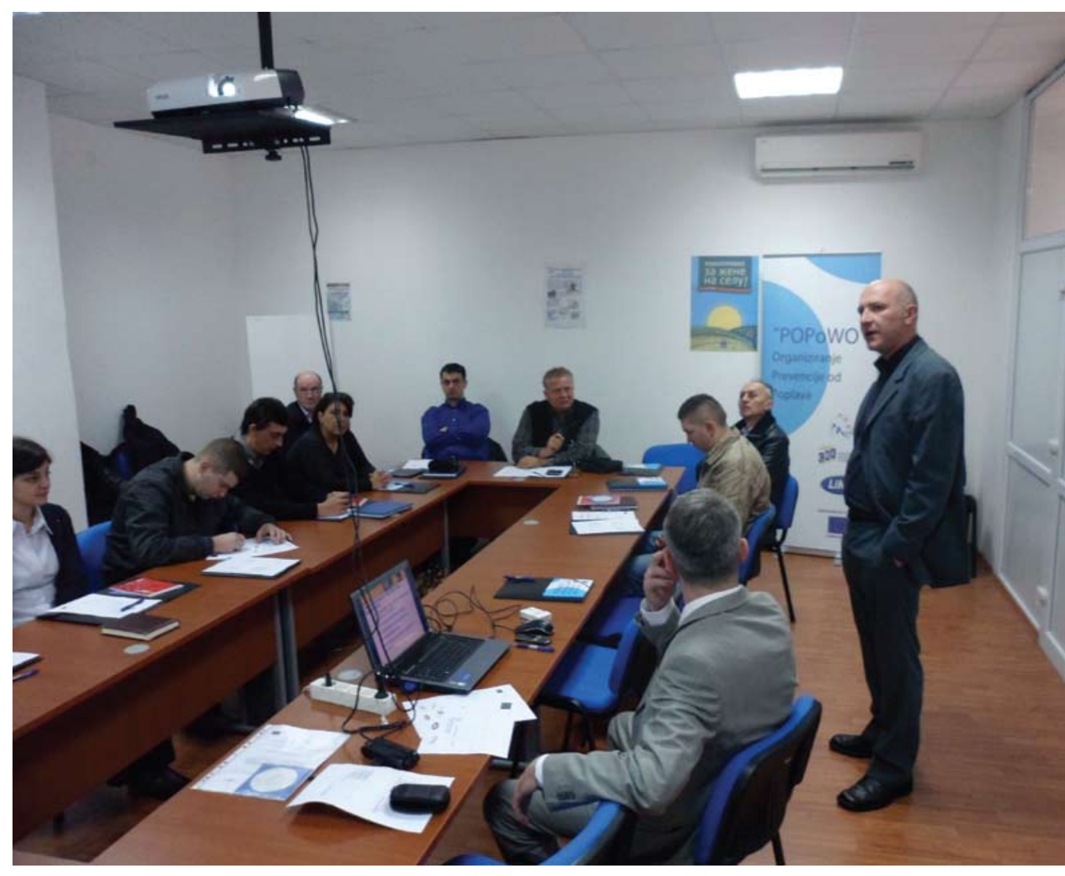
PCM trening u Trebinju, prosinac 2011.

• Final Conference and presentation of project results.