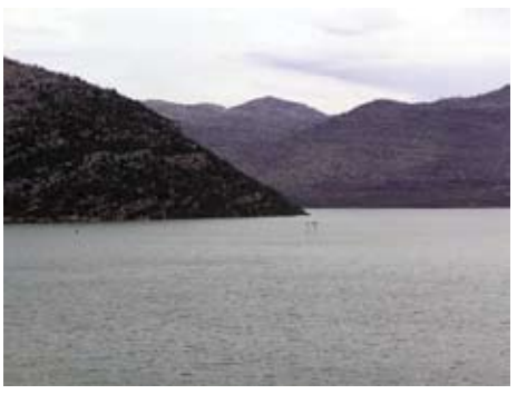
Popovo field under wather (fladded)