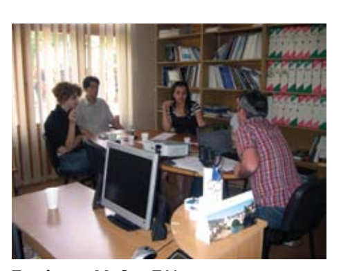
Trening za MoStar.T-V