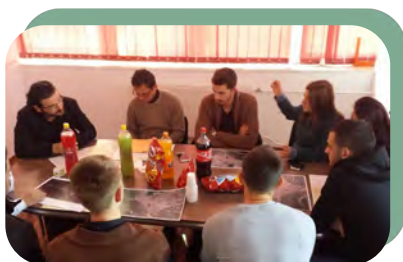
Mapping of the facilities, Peja

The idea of this activity was to assemble the young people from the local community together, and discuss with them on the possible development of their towns, which they, who represent the future of our communities, must have a say in. Young people of the communities of the partner organizations were encouraged to use their creativity and expressiveness to come up with possible improvements that can be done in their respective towns.